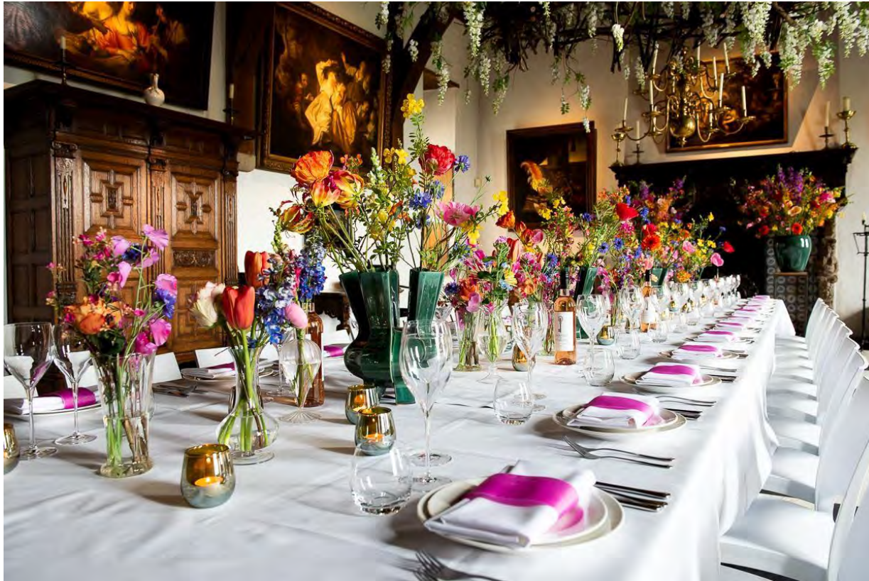
Splendid flower arrangement