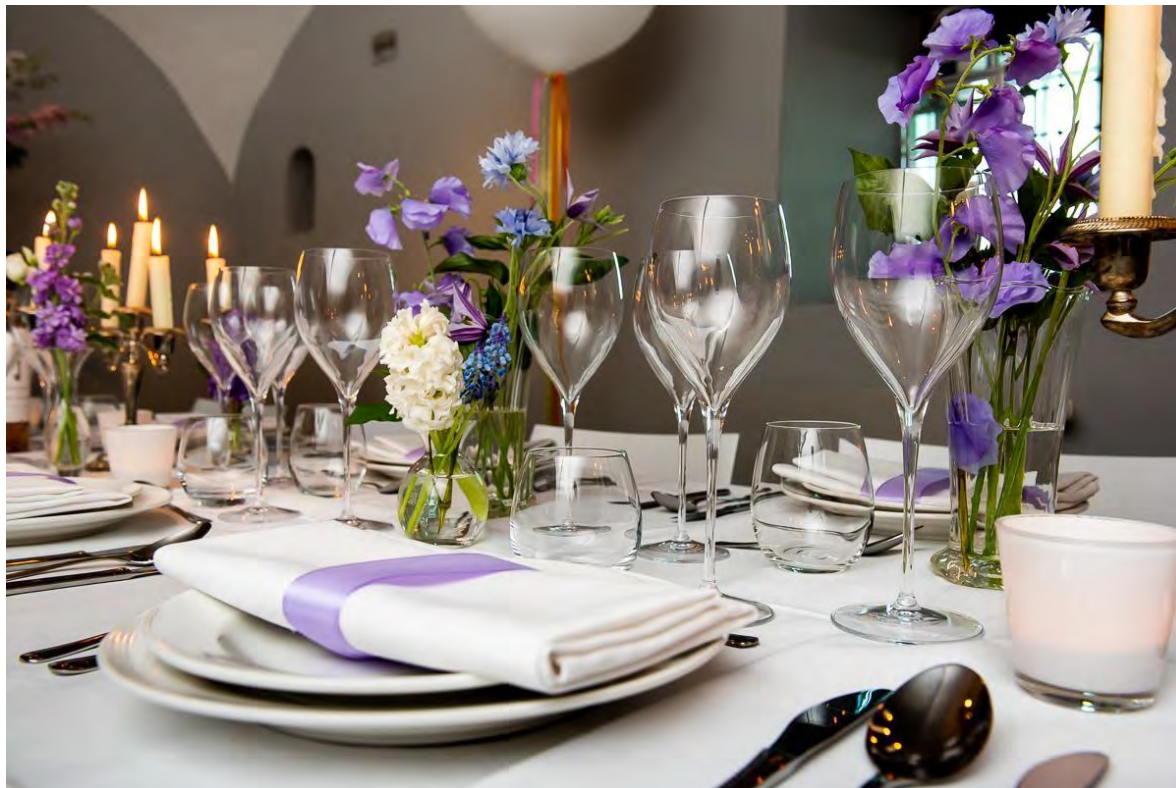
Spectacular table arrangement

One medium bouquet in a vase per 6 people: from €40 per vase Mix of 24 vases (long table with 24 people): from €8.50 p.p.